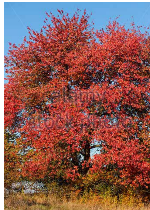
Flowerinf Cherries Prunus avium Plena "Bird Cherry".Prunus subhirtella Auminalis rosea "Winter Flowering Cherry"