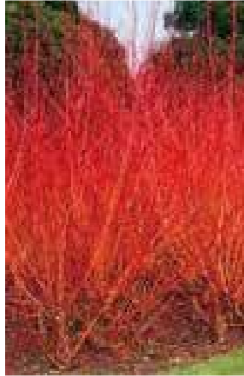
Red stemmed Willow Salix alba Britzensis in winter -copiced every 3-5 years