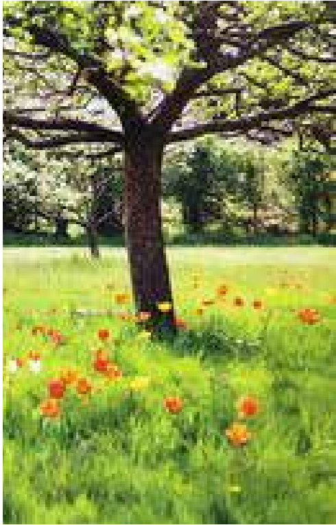
Blossom trees in meadow area and herbaceous gardens _