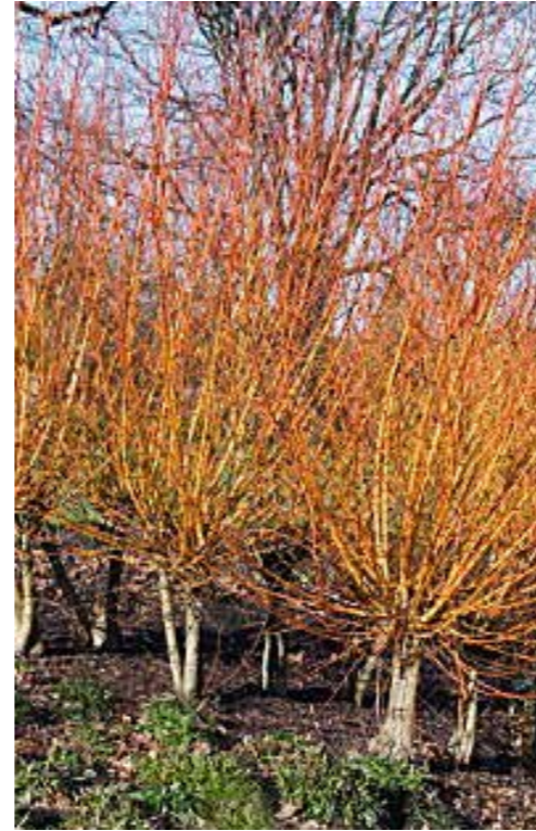
Golden stemmed Willow Salix alba Vitellina standards pollarded at 1.5-2m.