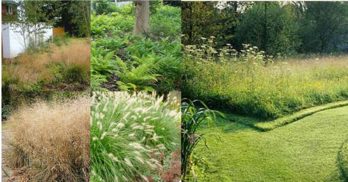
Frontage and side planting_ Multi stemmed Birch with shade tolerant grasses , sedge and ferns.