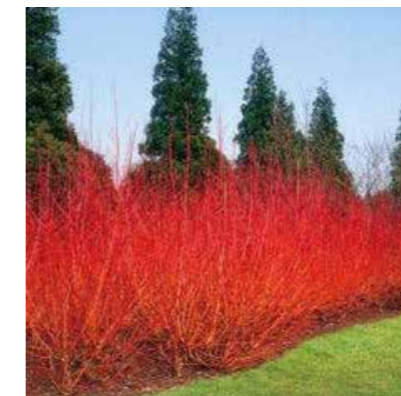
Red stemmed willow "Salix Britsensis" creating a natural frame