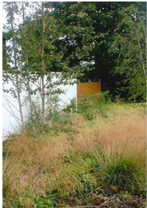
Frontage and side planting_ Multi stemmed Birch with shade tolerant grasses , sedge and ferns.Providing Winter bark effects and Autumn colour.