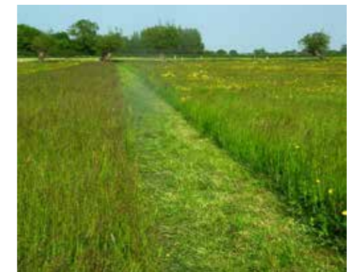
Mowed path_ meadows